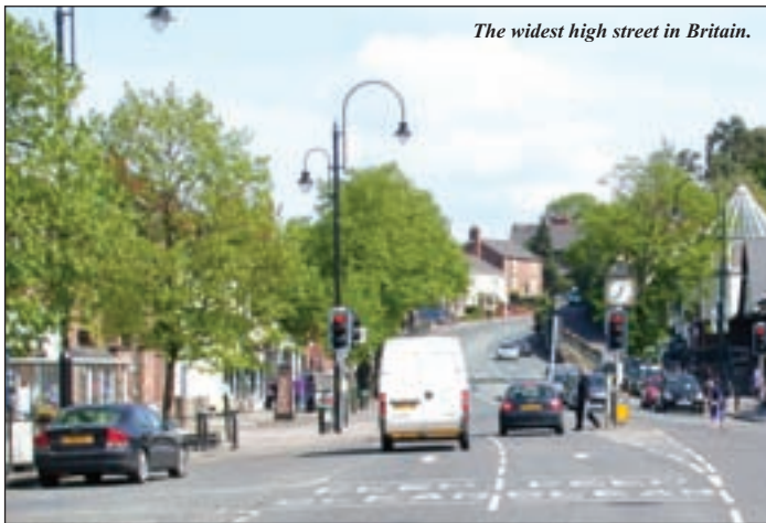
The widest high street in Britain.

CWC and the Love Frodsham delegates agreed findings of the workshop would best be used as a discussion guide to gain wider input prior to confirming a definitive brand and communications plan.