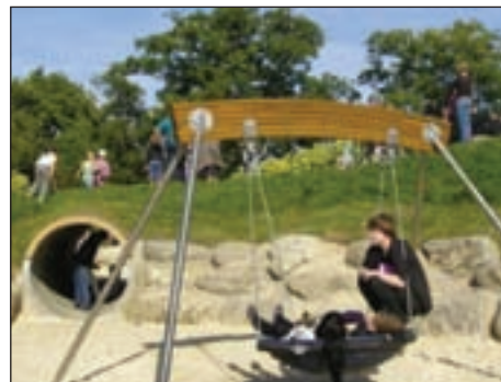
• Example of a well designed Playscape - Jubilee Way, Kingston upon Thames